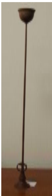
1st Place Ambrose O'Halloran