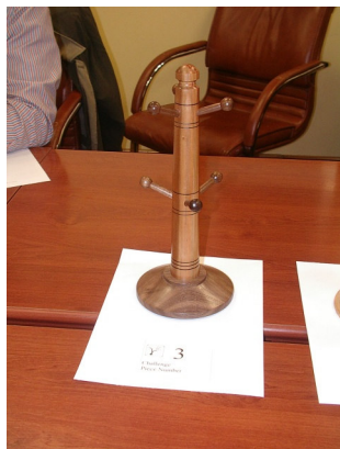
First Place Kevin Walsh