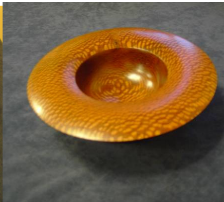
2nd Place Roger Greally