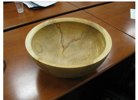
First place TimLydon