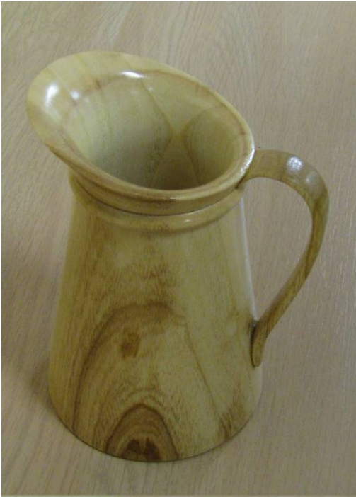
First place Kevin Walsh